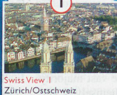
Swiss View 1 Zürich/Ostschweiz