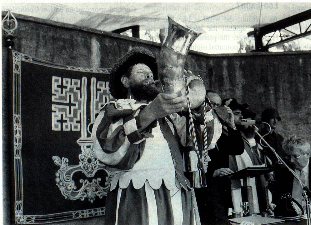
This picture belongs to the past. The Lower Unterwalden Landsgemeinde has served its purpose.

The rather low voter participation of 47% showed that even in Lower Unterwalden discussions about the Landsgemeinde did not generate that much interest. Landsgemeinden will still be held in both Appenzell half-cantons, as well as in Glarus and Upper Unterwalden. ■