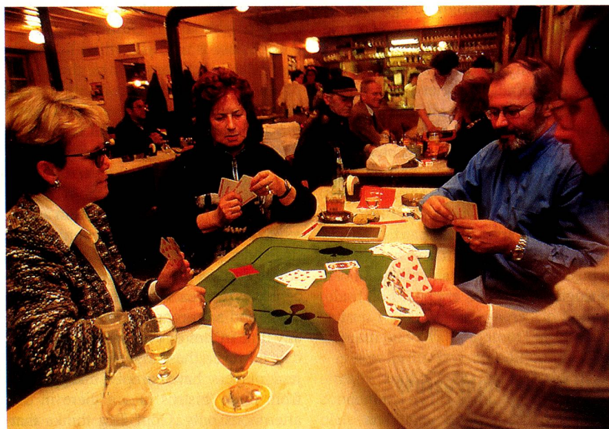
Inter-cultural jass game: a pleasant evening with instructive discoveries about friendly federal relationships.

role in this regard. And if a game of cards between habitués at the Café de Commerce does not need any particular preparation, it is quite a different matter when the players come from different quarters. Swiss Review decided to ex-