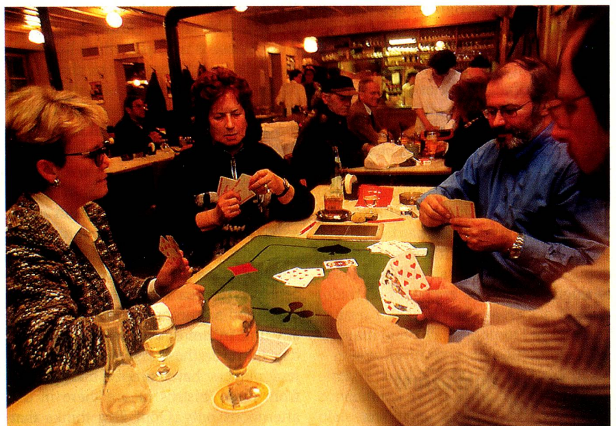
Inter-cultural jass game: a pleasant evening with instructive discoveries about friendly federal relationships.

role in this regard. And if a game of cards between habitués at the Café de Commerce does not need any particular preparation, it is quite a different matter when the players come from different quarters. Swiss Review decided to ex-