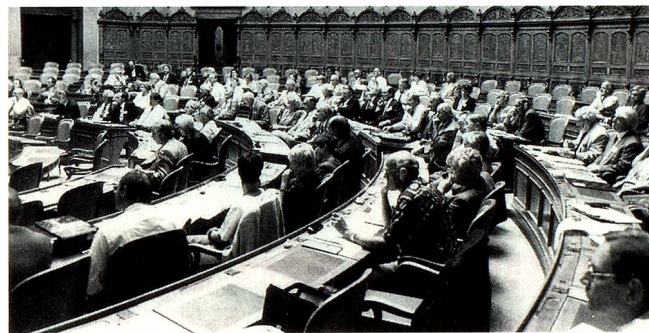
A well-attended meeting of the Council for the Swiss Abroad in the National Council chamber.

In the middle of its four-year period of office the Council for the Swiss Abroad met for its first public session in the Swiss parliament building. The dignified surroundings suited the important issues at hand.