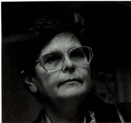
Ruth Dreifuss