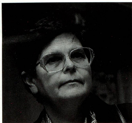
Ruth Dreifuss