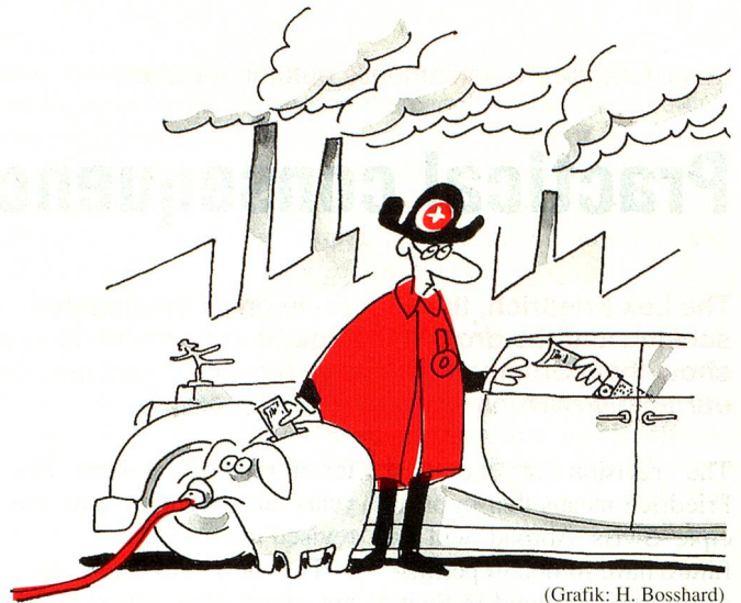
(Grafik: H. Bosshard)