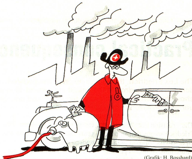
(Grafik: H. Bosshard)