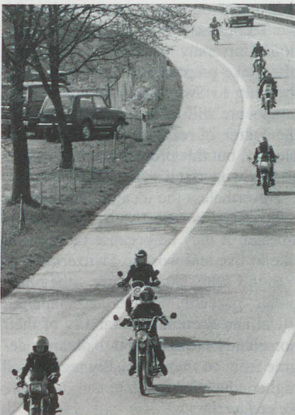
Motobikes hardly feel the recession: new registrations only 2.5% down.