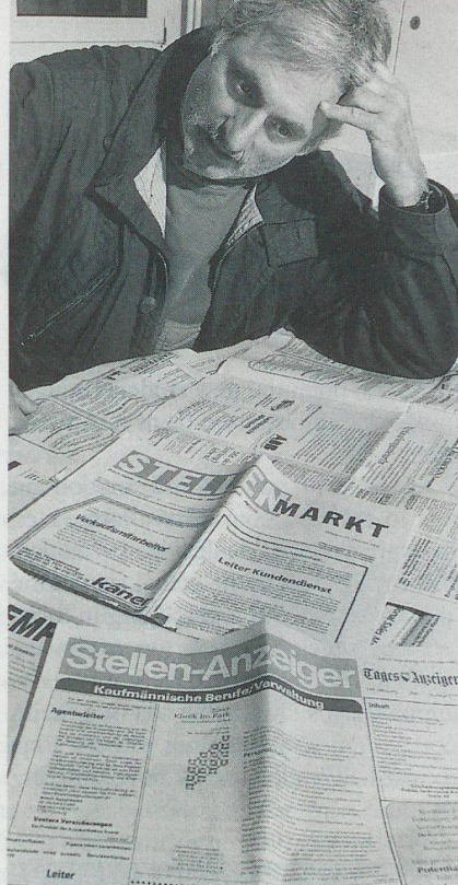
Ever more jobless and ever fewer vacancies: looking for a job is so difficult that resignation and depression are rife.