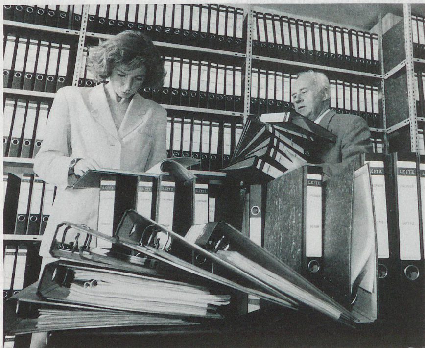
Career-oriented women between two fronts: either to be as professional as their husbands or, if they succeed, not to be real women.

When a woman plans her life nowadays, a job is usually included. Indeed it is a condition for her future independence. But much less automatic is the opportunity for qualified training leading to a job with chances of promotion. It is certainly true that more girls now take part in the first stage of non-compulsory education, higher secondary school, but that in itself does not mean that they have better opportunities of climbing the professional ladder. This depends on too many other factors, for example