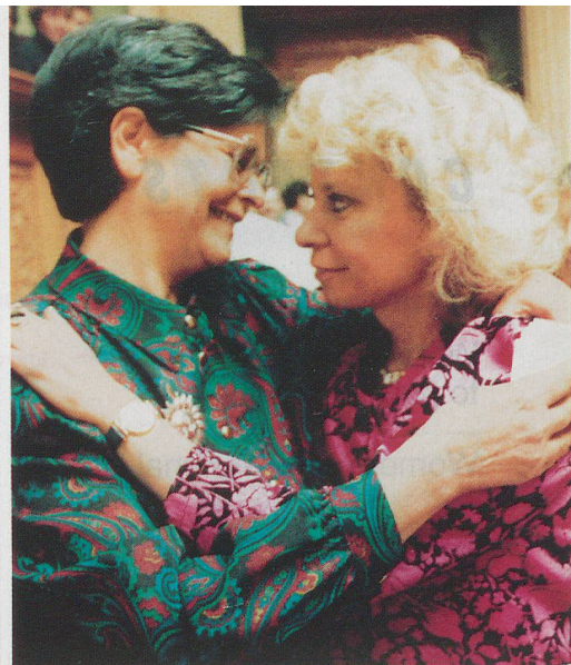
Christiane Brunner (left) congratulates her «political twin», Ruth Dreifuss, on her election to the Federal Council.

More than 20 years after Swiss women finally got the vote, one of the seven seats on the Federal Council is occupied – for the second time – by a woman. The entry of socialist Ruth Dreifuss into the federal executive is a milestone in the slow march by women towards political power. For the first time this has reached the very centre of the political process.