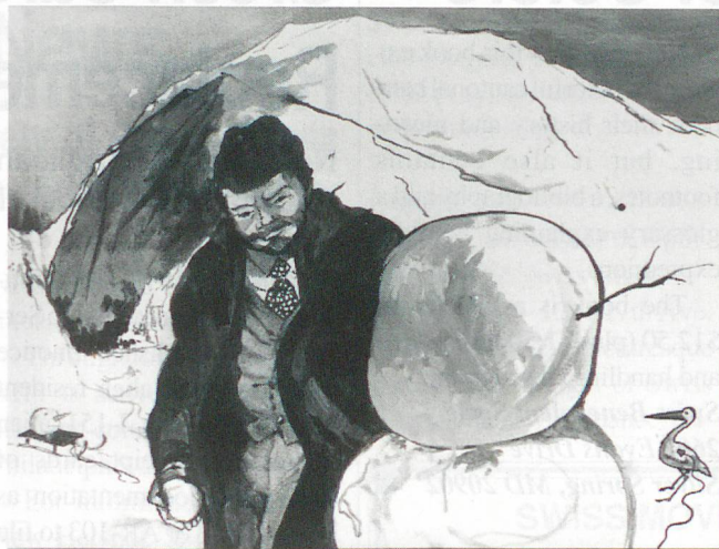
Inspection Medical Hermeneutics: "Switzerland + Medicine" Panel from Lenin's Corridor

The first exhibition this year analyzed how Swiss culture is viewed abroad, more specifically in the former Soviet Union: The Russian artist group "Inspection Medical Hermeneutics" installed a far-reaching work examining the impact of Swiss institutions like the Red Cross and the role that Zurich played for Russian refugees, among other topics. The result was a humorous and challenging installation that was reviewed extensively in the international media.