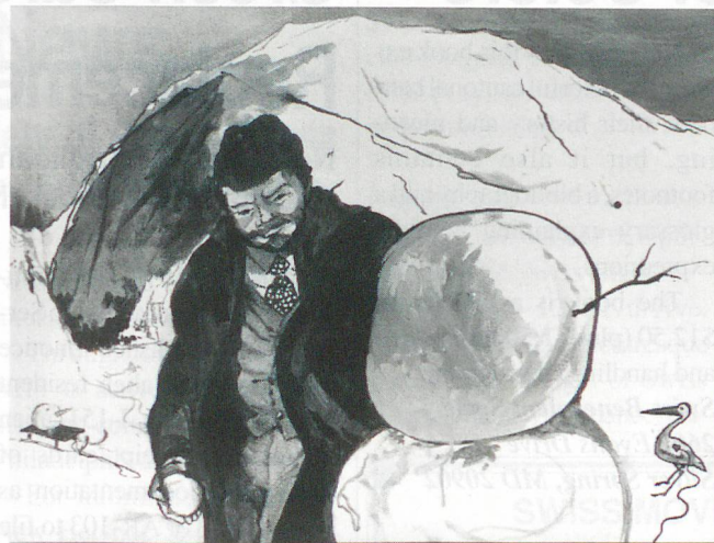
Inspection Medical Hermeneutics: "Switzerland + Medicine" Panel from Lenin's Corridor

The first exhibition this year analyzed how Swiss culture is viewed abroad, more specifically in the former Soviet Union: The Russian artist group "Inspection Medical Hermeneutics" installed a far-reaching work examining the impact of Swiss institutions like the Red Cross and the role that Zurich played for Russian refugees, among other topics. The result was a humorous and challenging installation that was reviewed extensively in the international media.