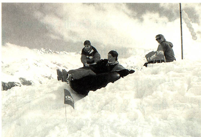
Fun and games are the best part of SSA camps.

Individuals and institutions who have contributed Sfr. 500 or more to the collection for the Place of the Swiss Abroad in Brunnen will be receiving the promised patronage certificates about now. If you are among those expecting such a certificate in the next few weeks and do not receive it, please let us know.