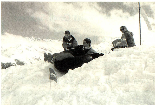
Fun and games are the best part of SSA camps.

Individuals and institutions who have contributed Sfr. 500 or more to the collection for the Place of the Swiss Abroad in Brunnen will be receiving the promised patronage certificates about now. If you are among those expecting such a certificate in the next few weeks and do not receive it, please let us know.