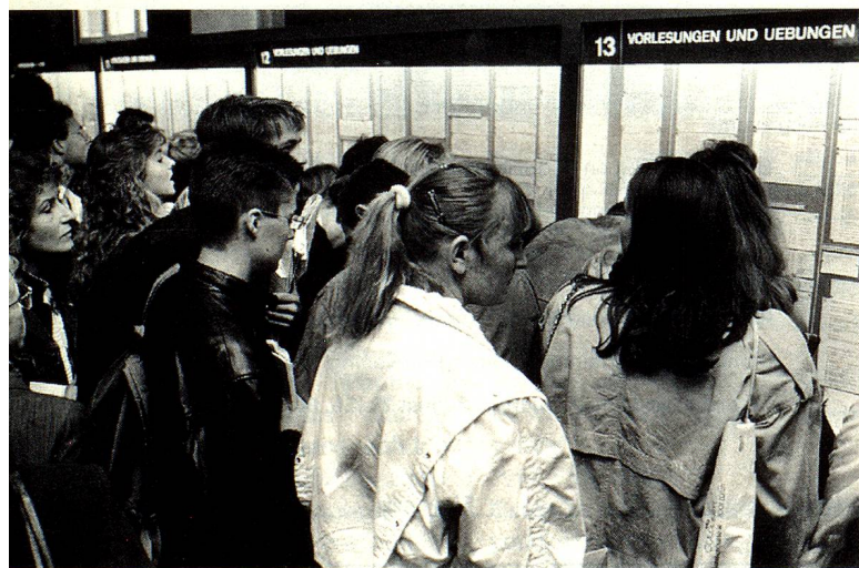
Any student registered at a university in the EC may participate in the ERASMUS programme.