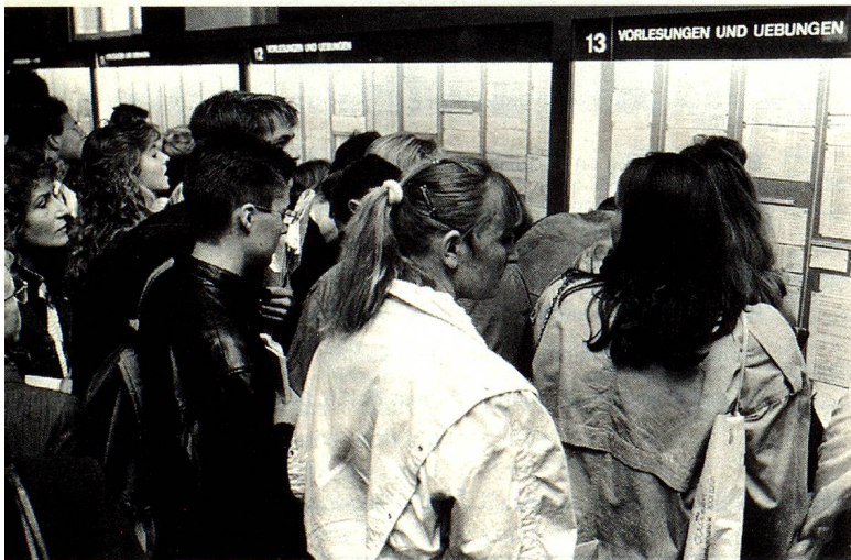
Any student registered at a university in the EC may participate in the ERASMUS programme.