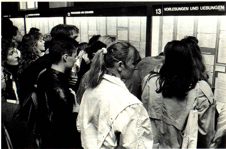
Any student registered at a university in the EC may participate in the ERASMUS programme.