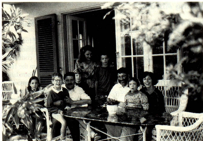
A Swiss family resident abroad makes friends with the host family in Switzerland.

Swiss abroad interested in the scheme were sent a holiday address through the "Begegnung 91" office in Solothurn. Guests and hosts then made contact, introduced each other and settled any changes of date themselves. For emergency cases, 55 regional offices, run on an honorary basis, were opened, thus reducing administration to a minimum. Individual initiative – which is always essential for worthwhile encounters – was sought. The Secretariat for the Swiss Abroad