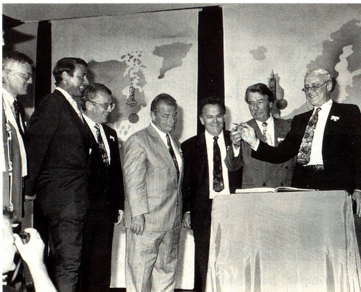
All seven members of the Federal Council sign the official guest book.

«... I congratulate Switzerland on this very special day. May Switzerland remain forever prosperous, may its mountains never crumble and may it keep producing chocolate...» (Indira Varma)