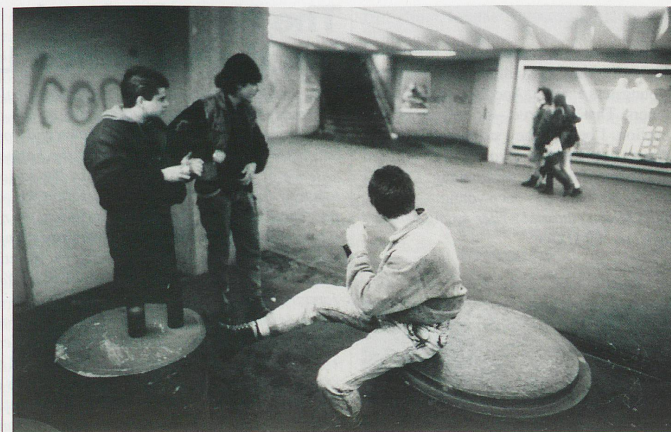
Hostility to foreigners.

My father is a typical Italian. He finds it difficult to come to terms with the fact that I'm growing up. For instance, I always have to be home for the evening meal, and if I want to eat out occasionally I have to tell him a week in advance. Of course I put up a fight against this sort of thing, and I've learned how to