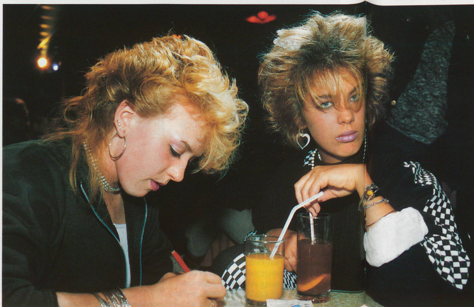
The difficulty of finding oneself. Bored consumerism.

I can't say I have any problems with people older than me. My best friend is 38. I also res-