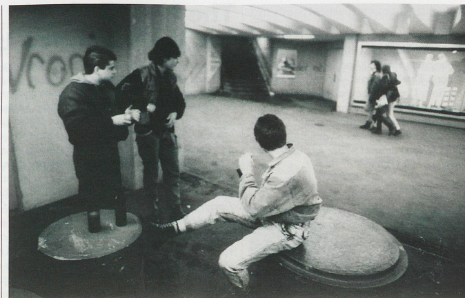
Hostility to foreigners.

My father is a typical Italian. He finds it difficult to come to terms with the fact that I'm growing up. For instance, I always have to be home for the evening meal, and if I want to eat out occasionally I have to tell him a week in advance. Of course I put up a fight against this sort of thing, and I've learned how to