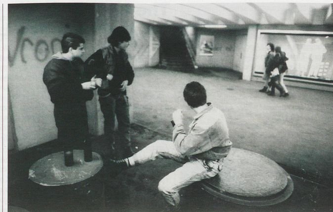
Hostility to foreigners.

My father is a typical Italian. He finds it difficult to come to terms with the fact that I'm growing up. For instance, I always have to be home for the evening meal, and if I want to eat out occasionally I have to tell him a week in advance. Of course I put up a fight against this sort of thing, and I've learned how to