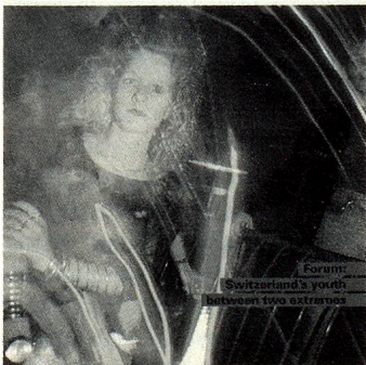
The disco – the much decried and passionately loved leisure activity par excellence of young people between 14 and 20.