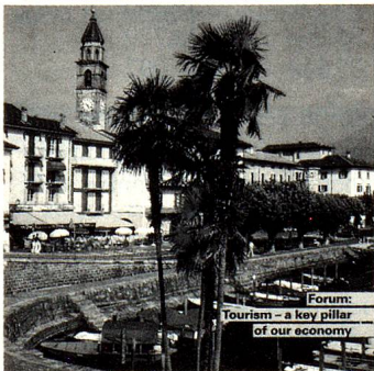
The former fishing village of Ascona on Lake Maggiore, lined with palms, attracts many tourists.

The Magazine for the Swiss Abroad 2/91 June 1991 Sfr. 3.-