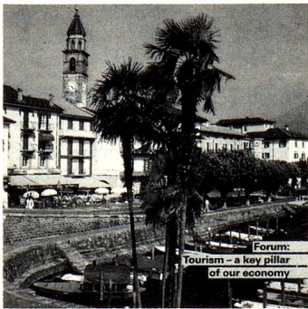
The former fishing village of Ascona on Lake Maggiore, lined with palms, attracts many tourists.

The Magazine for the Swiss Abroad 2/91 June 1991 Sfr. 3.-