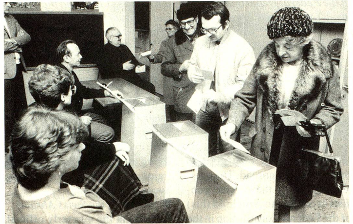
In future, no need for the Swiss abroad to come back to Switzerland in order to vote.

While one of the communes of origin or of previous domicile can still be chosen as the voting commune, the draft Act enables the Cantons to create a cantonal centre. This centre, instead of the voting communes, would be responsible for keeping a "Swiss Abroad Voting Register", for