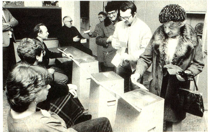
In future, no need for the Swiss abroad to come back to Switzerland in order to vote.

While one of the communes of origin or of previous domicile can still be chosen as the voting commune, the draft Act enables the Cantons to create a cantonal centre. This centre, instead of the voting communes, would be responsible for keeping a "Swiss Abroad Voting Register", for