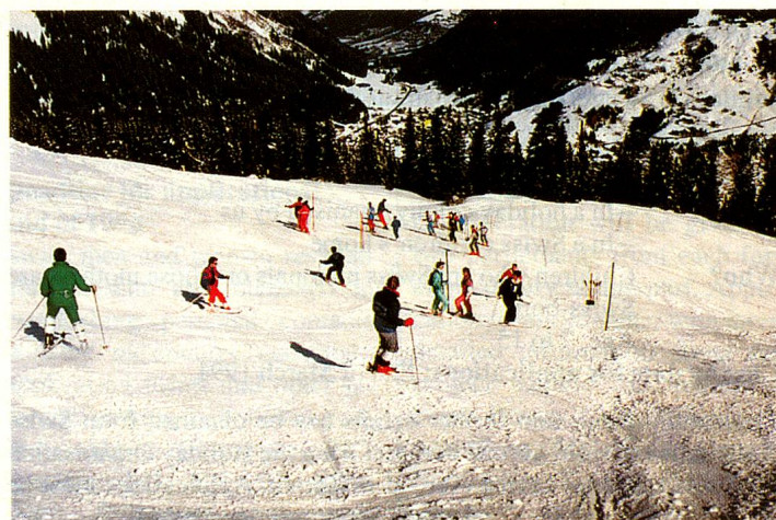
Attractive offers introduce participants to the art of skiing – and it's fun, too.

Registration: Deadline for applications is 18-02-91. Forms are obtainable from: Auslandschweizer-Sekretariat, Jugenddienst, Alpenstrasse 26, CH-3000 Berne 16. The number of participants will be limited to 60.