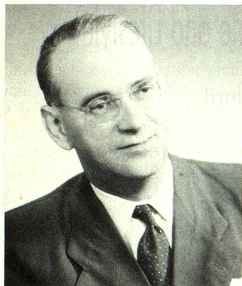
Carl Lutz.

In 1944, Carl Lutz, at the time Swiss Vice-Consul and head of the Protecting Power Department in Budapest, hit on a clever method for saving the lives of thousands of Hungarian Jews. In his honour, a bronze monument will be unveiled in December in the centre of the Hungarian capital.