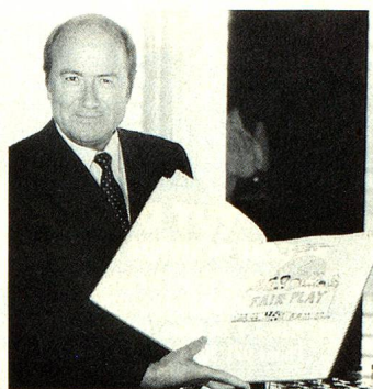
Joseph Blatter.

So it is understandable that when this year's World Championship games took place, it was in the spirit of fair play and true sportsmanship, and that measures to ensure this were put in-