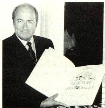
Joseph Blatter.

So it is understandable that when this year's World Championship games took place, it was in the spirit of fair play and true sportsmanship, and that measures to ensure this were put in-