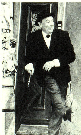
Ruedi Walter in "Die kleine Niederdorfoper".

On June 16, Ruedi Walter died, at the age of 73. For countless Swiss he had for decades been the actor of our times. In cabaret performances, in films based on Gotthelf stories, in famous stage plays like Beckett's "Waiting for Godot" or in radio sketches on Saturday afternoons, together with his ideal partner Margrit Rainer, that almost became an institution, Ruedi Walter had always understood how to make his audience laugh, without ever lapsing into cheap or vulgar comedy.