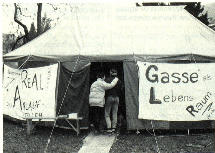
Berne's Kleine Schanze, where a heated tent provides temporary relief from the miserable life of drug addicts