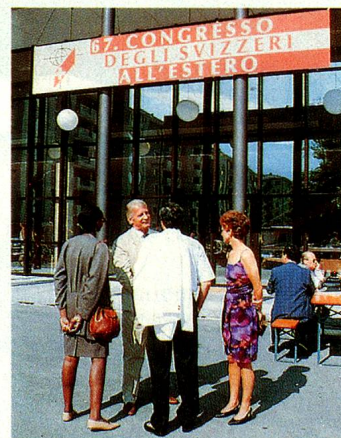
Venue of the meeting: The Congress of the Swiss Abroad.