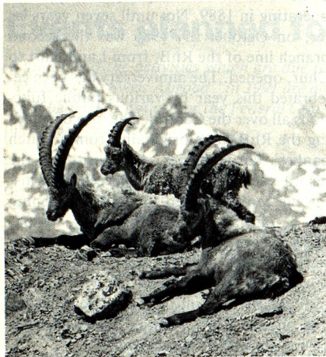
The ibexes released in 1930 today form a big colony.

strialisation and population growth were already pushing Nature back, step by step, a hundred years ago.