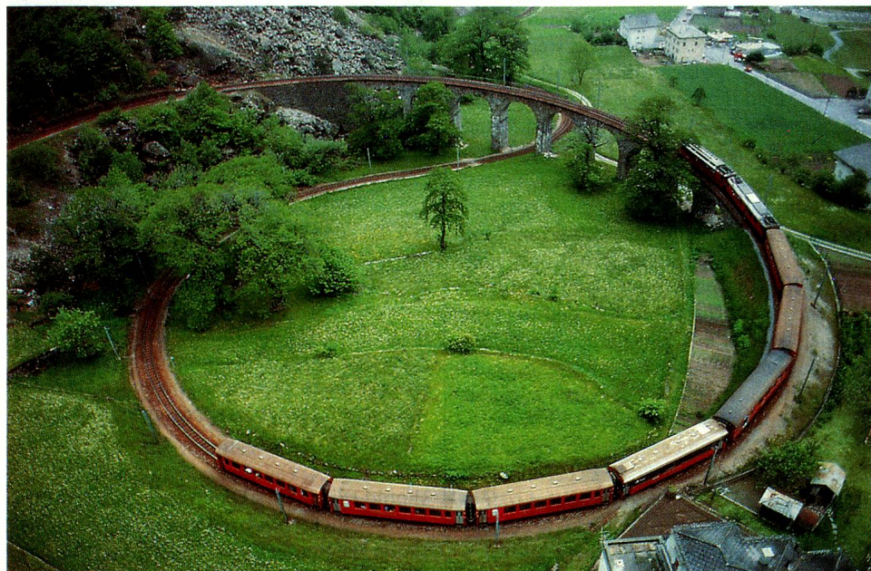
Circular viaduct to overcome the steep gradient near Brusio in the Poschiavo region.

On October 5, 1889 the inaugural train drove through the Prättigau region on the railway line from Landquart to Davos. That was the very first line of what is today called the “Rhätische Bahn” (“RhB”). Strictly speaking this would in English mean “The Rhaeto-Romanic Railway”, the name being