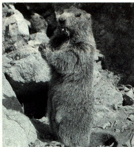
In spite of the protection provided in the National Park, the marmots have not increased much in numbers. Many have been victims of the golden eagles!

The core of the National Park was placed under protection already in 1909, thanks to the initiative taken by a group of nature lovers. Soon afterwards, further areas were added, the official take-over by the Confederation occurred on August 1, 1914. Since then, there have been further extensions, resulting in a total area of 169 square kilometres (65 square miles). The Park is the oldest wild-life sanctuary in Central Europe. "It is more important than ever, at a time when care of our environment is causing so much anxiety, that such a truly comprehensive reserve