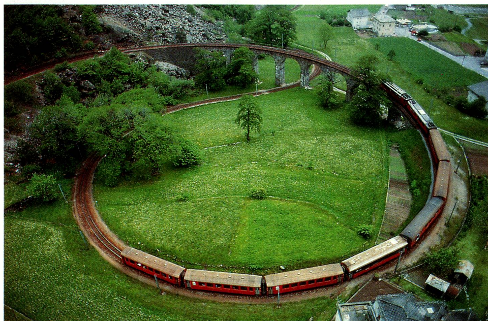
Circular viaduct to overcome the steep gradient near Brusio in the Poschiavo region.

On October 5, 1889 the inaugural train drove through the Prättigau region on the railway line from Landquart to Davos. That was the very first line of what is today called the “Rhätische Bahn” (“RhB”). Strictly speaking this would in English mean “The Rhaeto-Romanic Railway”, the name being