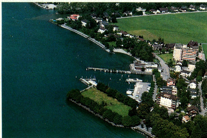
Expatriate Swiss architects will be proposing designs for the treatment of this peninsula.

Foundation for the "Place of the Swiss Abroad"