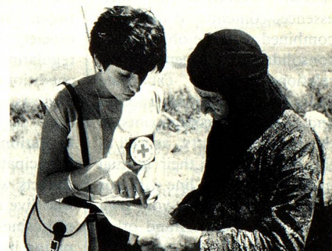
Lebanon: The ICRC also helps in the exchange of messages between separated members of a family.

In 1977 a further diplomatic conference prepared two supplementary Protocols, which were aimed at improving the protection afforded to the civilian population in international conflicts and at defining the status of irregular combatants (Protocol I), and at ex-