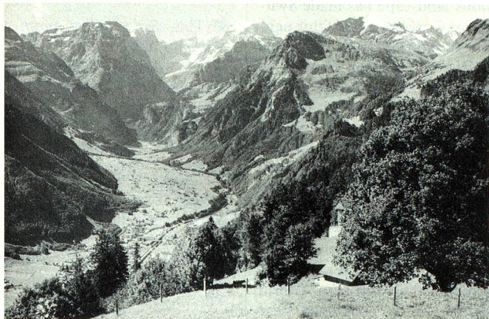
Braunwald with a view towards Linthal.

There are eight car free alpine resorts in Europe – and they are all in Switzerland: Braunwald in canton Glarus, Stoos in canton Schwyz, Mürren and Wengen in the Bernese Oberland as well as Bettmeralp, Riederalp, Saas Fee and Zermatt in Valais. This year they have joined forces to promote their common aim under the general title «Association for car free holiday resorts in Switzerland».