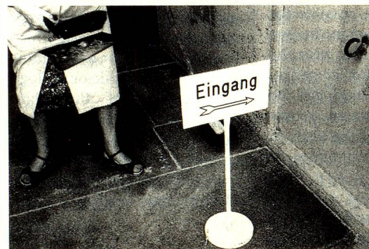
It's not always easy to find your way through the maze of bureaux.

The New Helvetic Society's Secretariat for the Swiss Abroad (SSA) , on the other hand, is a private institution. It is the secretariat of the Organization of