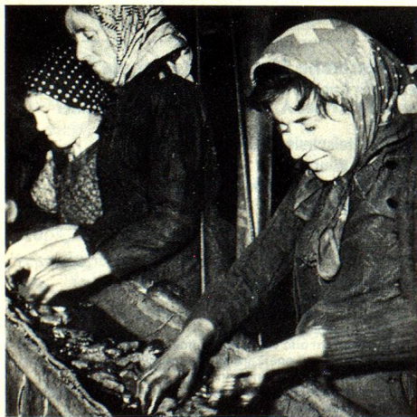
Sorting coal, Valais, 1947.