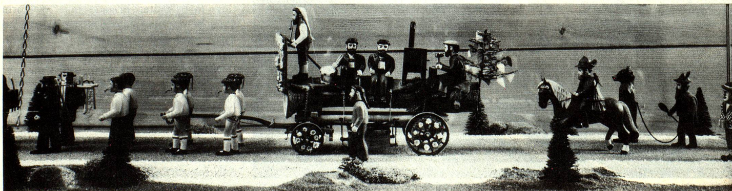
The museum at Urnäsch.

In Switzerland there are now more than 600 museums of every kind, which in fact gives our country the greatest museum density in the world. This number should rise to 700-800 museums by the year 2000, the largest increase today being in the number of Heimat (local history and culture) museums.