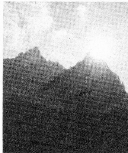
Mythen (Canton Schwyz)