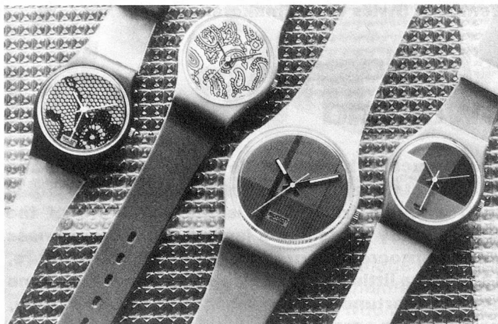
The Swatch autumn and winter collection 1985-86.

have the shape of a watch, something which would be a watch but something which would no longer necessarily be a symbol of a long tradition. Rather, a symbol of its own time, with a unique identity, a whiff of adventure, a kind of exclamation mark of fashion. It was not yet a product but already a presentiment.