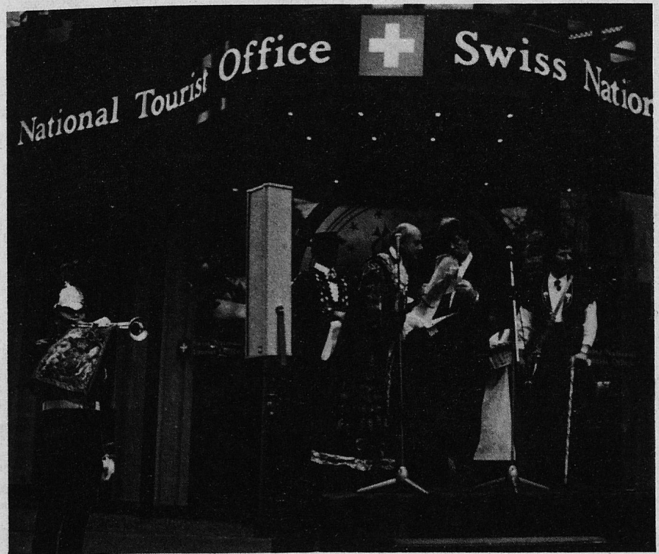
Presentation of the Scroll by National Councillor J. J. Cevey to the Lord Mayor of Westminster.

Commissioned by the Swiss National Tourist Office , with the financial help of the Swiss Confederation, the Principality of Liechtenstein, the Swiss Cantonal Authorities, and many official and commercial organisations of Switzerland.