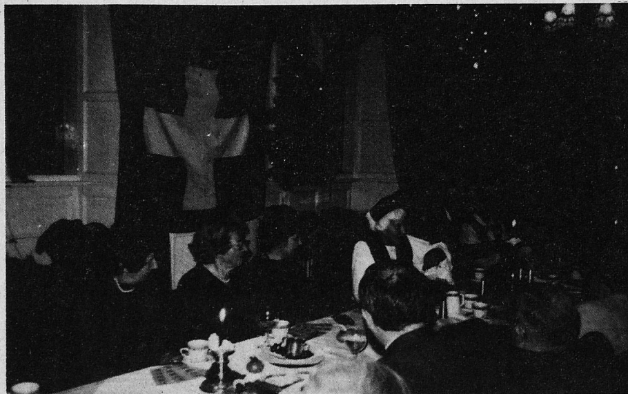
Christmas Party – Paignton

The last gathering of 1985 for the Yorkshire Swiss Club was an excellent dinner of "Yorkshire Fayre", prepared for us at the Social Club of "West Yorkshire Passenger Transport Executive Social Club" (W.R.P.T.E.) in Leeds. 35 members