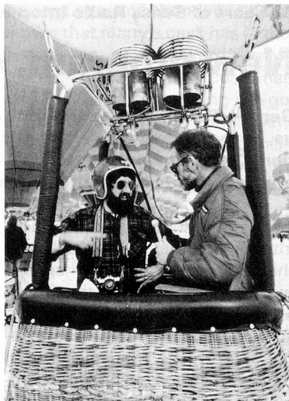
The English Service in action.