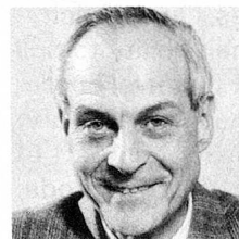
Pro: Dr. Rudolf Friedrich, FDP, former Federal Councillor and Attorney-at-Law, Winterthur

now, and the resulting experiences. The prevailing attitude could be described as taking part without the rights of a full membership. Experiences show that any further staying away from the main executive bodies has disadvantages , which are clearly greater than the advantages of