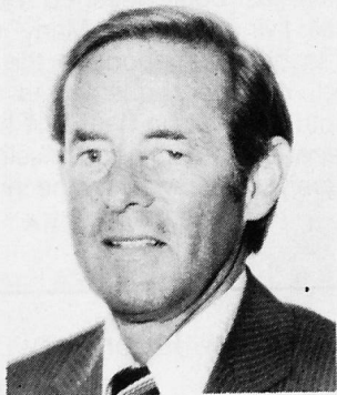
Consul General Wolf

The Federal Council has appointed me as Consul General of Switzerland in Sydney, and the Governor General of the Commonwealth of Australia has authorized me to perform these functions, with jurisdiction throughout the Australian Capital Territory, the States of New South Wales and Queensland, the Northern Territory and the external territories under Australian sovereignty.