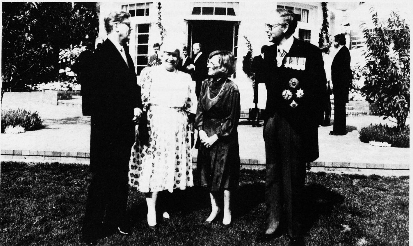
From left to right:

This might (might!) be the title of a comprehensive, nicely printed and illustrated study to be published as a contribution to the Australian Bi-centenary, researched and realised by professionals with the help of Swiss all over the country and back home, and with