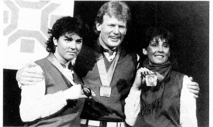
On 16th February 1984, Switzerland won three medals on one day: from left to right: Michela Figini (gold, women's descent), Peter Müller (silver, men's descent), Maria Walliser (silver, women's descent).