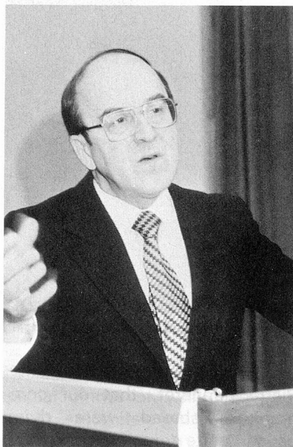
Our guest of honour, Federal Councillor Kurt Furgler.

there were changes. Instead of having the plenary session on Saturday, it took place already on Friday. It began with the official opening at which the Basle Municipal Band entertained the assembled participants. This meeting was the highlight of the whole congress.