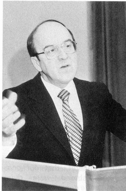
Our guest of honour, Federal Councillor Kurt Furgler.

there were changes. Instead of having the plenary session on Saturday, it took place already on Friday. It began with the official opening at which the Basle Municipal Band entertained the assembled participants. This meeting was the highlight of the whole congress.