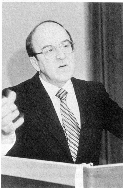
Our guest of honour, Federal Councillor Kurt Furgler.

there were changes. Instead of having the plenary session on Saturday, it took place already on Friday. It began with the official opening at which the Basle Municipal Band entertained the assembled participants. This meeting was the highlight of the whole congress.