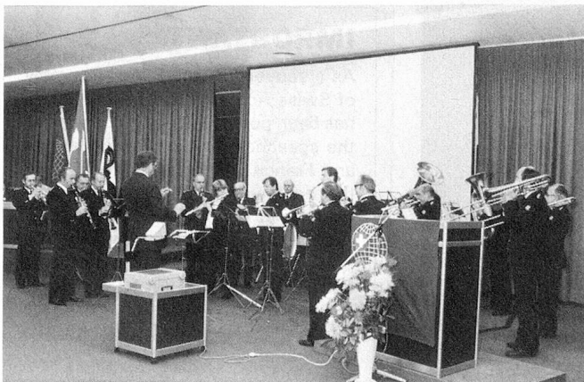
Friday morning's plenary session.