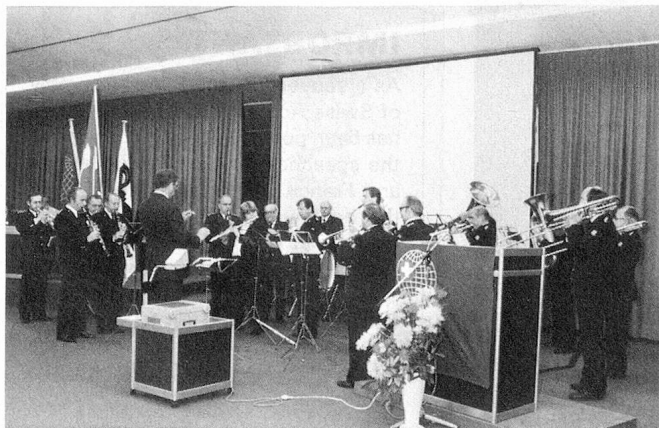
Friday morning's plenary session.