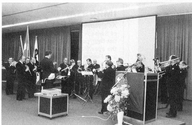
Friday morning's plenary session.