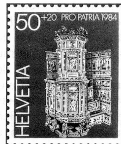
50 + 20 c. Freulerpalast, Näfels Palais Freuler, Näfels Palazzo (Freuler), Näfels