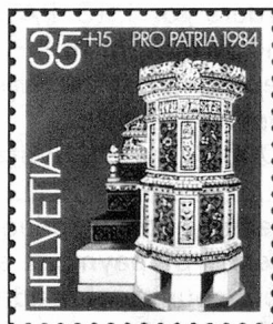
35 + 15 c. Landesmuseum, Zürich Musée nationale suisse, Zurich Museo nazionale svizzero, Zurigo

This year, the bulk of the money collected will go to bodies working in favour of Swiss nationals living abroad; this has been done every 6 or 7 years since 1924. The Organization of the Swiss Abroad and its permanent secretariat in Berne and the Committee to help Swiss schools abroad are the chief recipients.