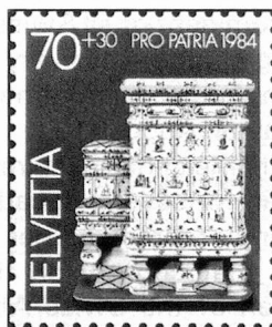
70 + 30 c. Musée gruérien, Bulle