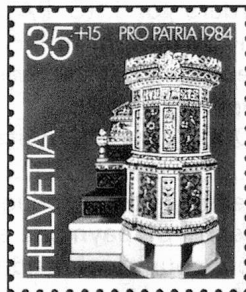
35 + 15 c. Landesmuseum, Zürich Musée nationale suisse, Zurich Museo nazionale svizzero, Zurigo

This year, the bulk of the money collected will go to bodies working in favour of Swiss nationals living abroad; this has been done every 6 or 7 years since 1924. The Organization of the Swiss Abroad and its permanent secretariat in Berne and the Committee to help Swiss schools abroad are the chief recipients.