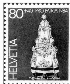
80 + 40 c. Museum Ariana, Genf Musée Ariana, Genève Museo Ariana, Ginevra