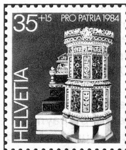
35 + 15 c. Landesmuseum, Zürich Musée nationale suisse, Zurich Museo nazionale svizzero, Zurigo

This year, the bulk of the money collected will go to bodies working in favour of Swiss nationals living abroad; this has been done every 6 or 7 years since 1924. The Organization of the Swiss Abroad and its permanent secretariat in Berne and the Committee to help Swiss schools abroad are the chief recipients.