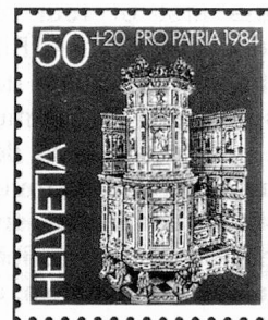
50 + 20 c. Freulerpalast, Näfels Palais Freuler, Näfels Palazzo (Freuler), Näfels