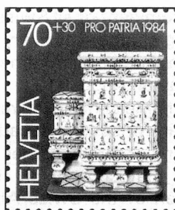
70 + 30 c. Musée gruérien, Bulle