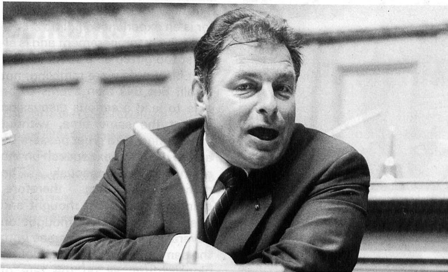
Mr. Jean-Pascal Delamuraz, Federal Councillor