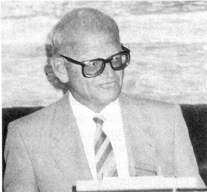
Federal Councillor Alphons Egli.

An estimated 480 Swiss people from abroad, among them a number of recruits, came together in Zurich from August 26 to 28 in order to meet and exchange views on questions of mutual interest. Friday's question time and the following opening reception were well attended. The program went on with a general discussion about Switzerland's entry into the UNO, which was held in the auditorium of the university on Saturday; in the evening, at a dinner and dance, participants enjoyed Elsie Attenhofer's revue – her name reminds us of the group called «Cornichon», and still symbolizes the Swiss spirit of resistance of the World War II era. The meeting was pleasantly rounded off on