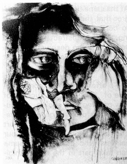
Claudia Butler «Metamorphosis» (USA)

After 5 p.m. the exhibition was opened to the public. An outstanding art critic passed the following judgment on the over 120 works exhibited: