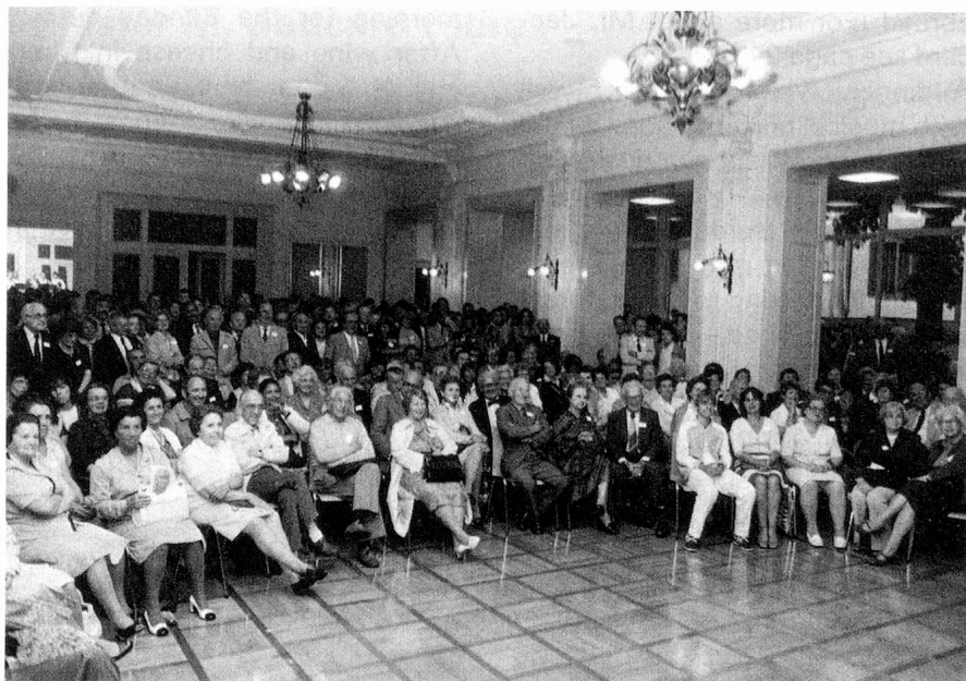
During the official opening