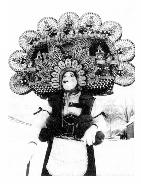
Old dances are still perpetuated in Switzerland