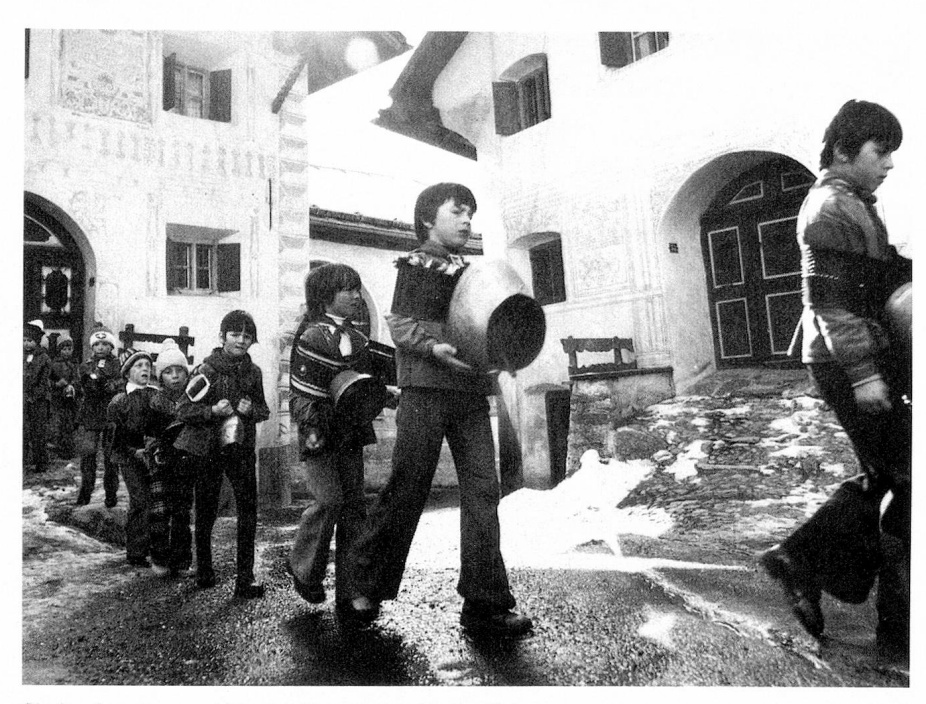
Chalandamarz, an old springtime custom in the Grisons.

All these groupings demand the right to take part in the formulation of public opinion, to be consulted and to be allowed to express their opinion officially. We have in all seriousness to ask ourselves whether the diversity of our society has not induced us to take consultative promulgation rather too far. We run the risk of losing our free will, because too