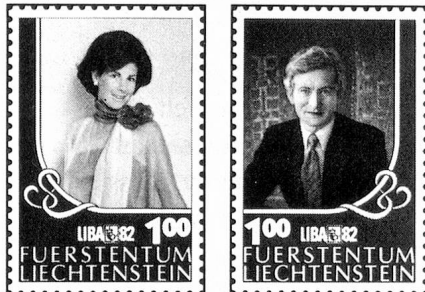
Special stamps «LIBA '82»