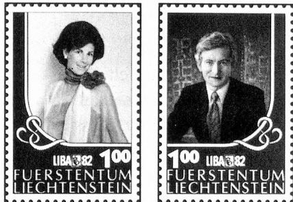
Special stamps «LIBA '82»