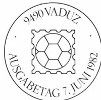
Special stamps «Football World Championship 1982 Spain»