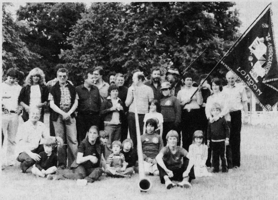
End of season meeting at Bisley 1981.

6th June 27th June 5th September 19th September 17th October