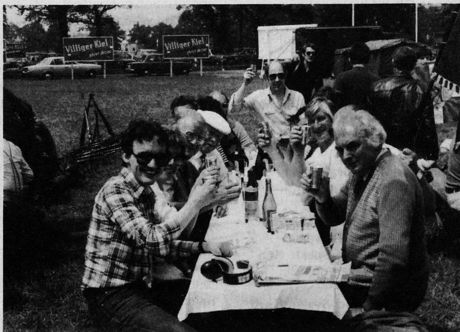
S.R.A. Team at the TIR Federal Luzern.

Pistol shooting is also held at Bisley and on 31st October and 12th December at the elite Marylebone Pistol Club in the City of London.