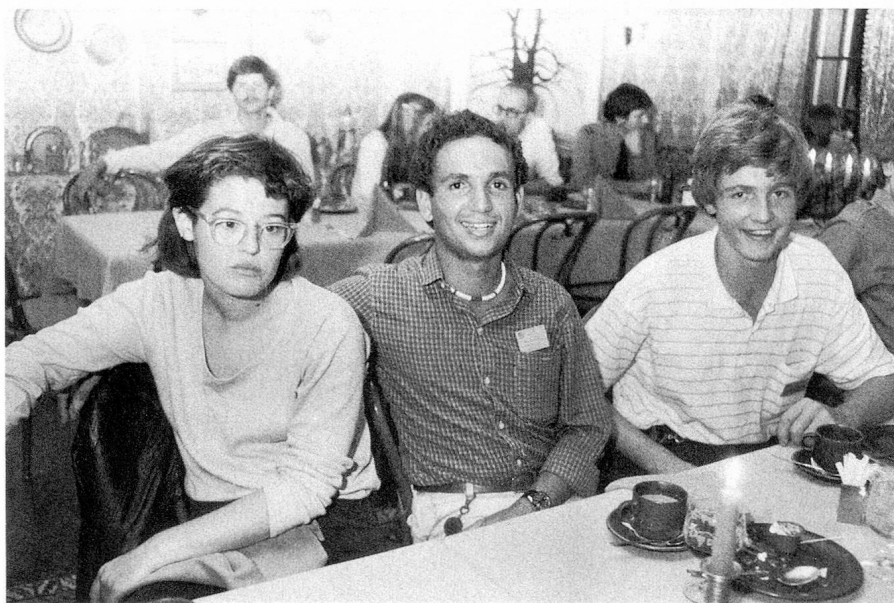
Dinner of the young Swiss abroad

Send to: Secretariat of the Swiss Abroad Alpenstrasse 26, 3000 Bern 16