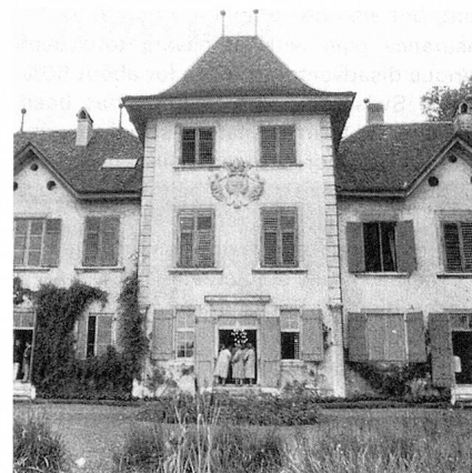
View of the castle of Waldegg