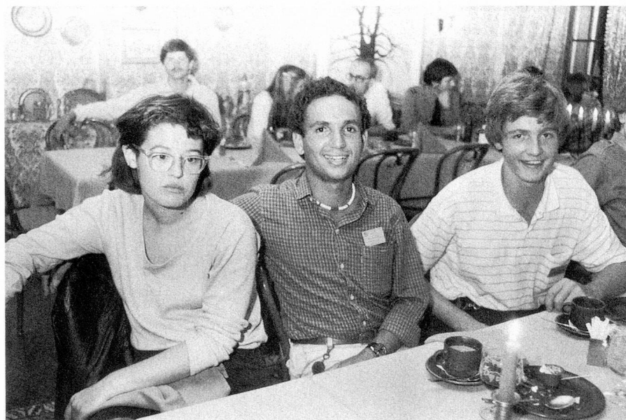
Dinner of the young Swiss abroad