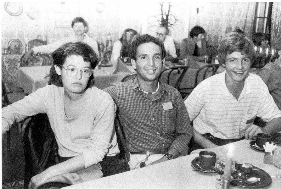
Dinner of the young Swiss abroad