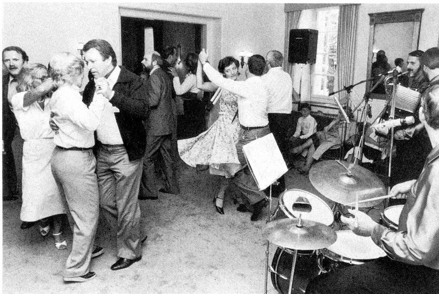
High spirits at the Dance at Bad Attisholz

Federal Government deserved thanks for stating clearly and to the point that being a Swiss abroad is not a thing of folklore: «Again and again I have to admire the energy with which people of all classes and all ages in our nation go abroad to seek a new life, and in doing so find stamina which they would hardly have considered possible earlier.» Federal Councillor Honegger also joined with the Swiss abroad in the hope that further cuts in the contributions to the