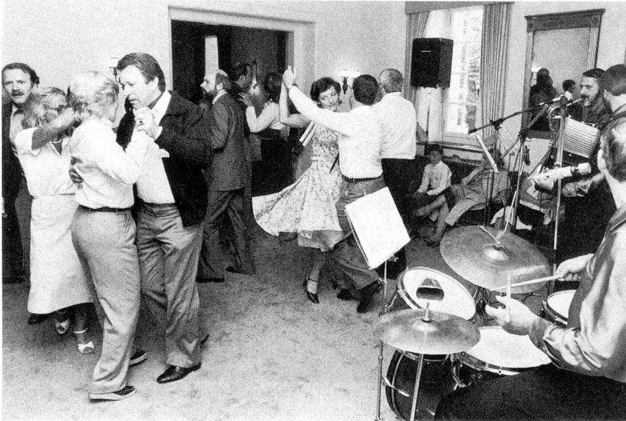
High spirits at the Dance at Bad Attisholz

Federal Government deserved thanks for stating clearly and to the point that being a Swiss abroad is not a thing of folklore: «Again and again I have to admire the energy with which people of all classes and all ages in our nation go abroad to seek a new life, and in doing so find stamina which they would hardly have considered possible earlier.» Federal Councillor Honegger also joined with the Swiss abroad in the hope that further cuts in the contributions to the