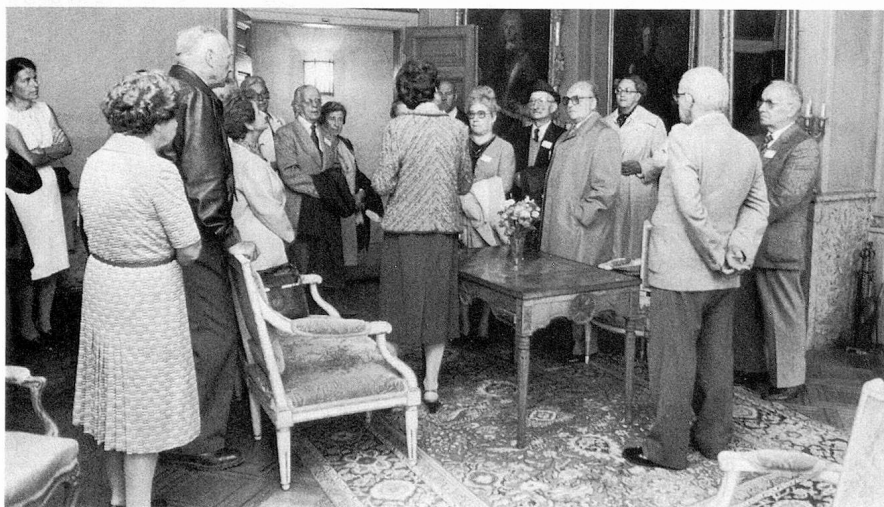
Guided tour of the castle of Waldegg