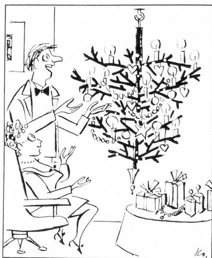
«Quite a change, darling, isn't it?»

The format of the book is large, 24x30 cm. It has 196 pages and contains over 350 illustrations in colour. To be bought at Editions 24 Heures, Avenue de la Gare 39, 1001 Lausanne, at the price of SFr. 44.50.