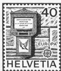
Historischer Briefkasten aus Basel Boîte aux lettres historique de Bâle Buca delle lettere storica di Basilea