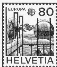
Alpine Relaisstation Jungfrau-Joch Station relais alpine du Jung- frau-Joch Ripetitore d'alta montagna dello Jungfrau-Joch

The import of foreign bank notes for the equivalent of more than 20000 Swiss Francs per person and quarter is no more prohibited since 24 January 1979.