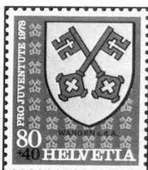
Wangen a. d. A. (BE)