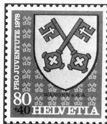
Wangen a. d. A. (BE)