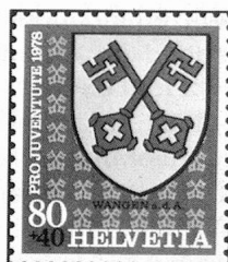
Wangen a. d. A. (BE)