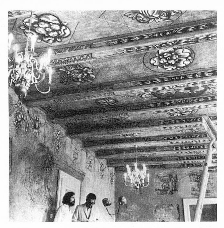
... and after exploratory excavations

The Confederation promulgated the Act concerning the Protection of Nature and the Landscape in 1966 on the strength of Article 24 sexies of the Federal Constitution, approved by the people and the cantons in 1962. This had enshrined in the Constitution the Confederation's responsibility for protecting monuments, which had