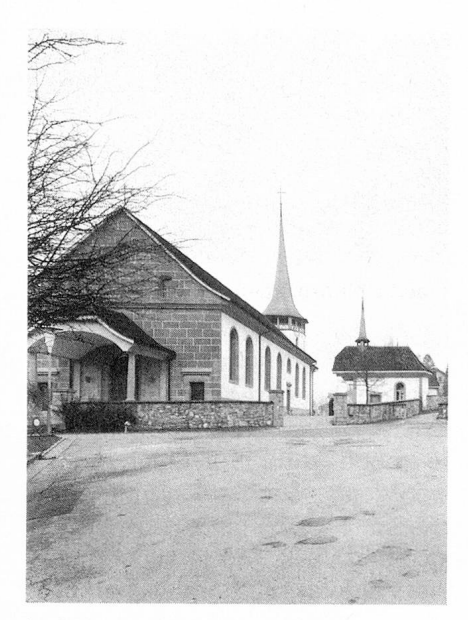
In Tavel (FR), the basically Gothic parish church and the ossuary have been restored